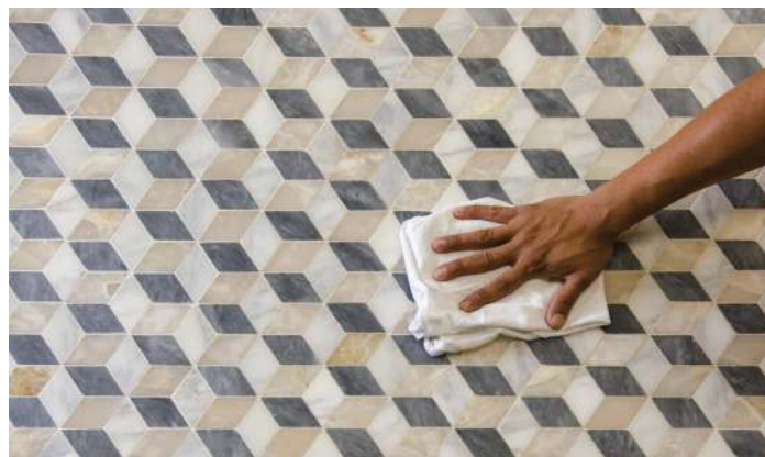
Step 10 For final removal of grout haze, polish with a clean, soft, white cloth.