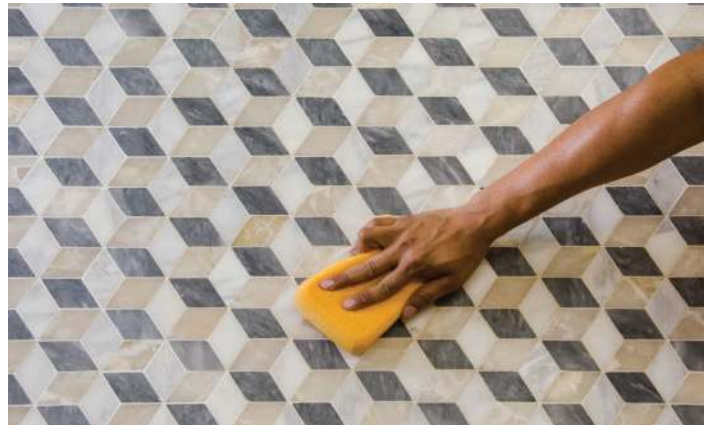
Step 9 Allow grout to set until firm and smooth finish with a damp sponge. After approximately 2 hours, remove grout haze with a lightly damp sponge.