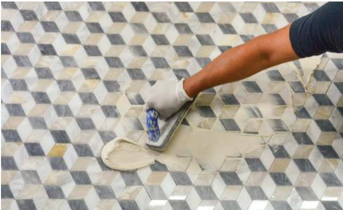
Step 8 Apply grout with a rubber grout float, forcing grout into joints until full. Remove excess grout with edge of float.