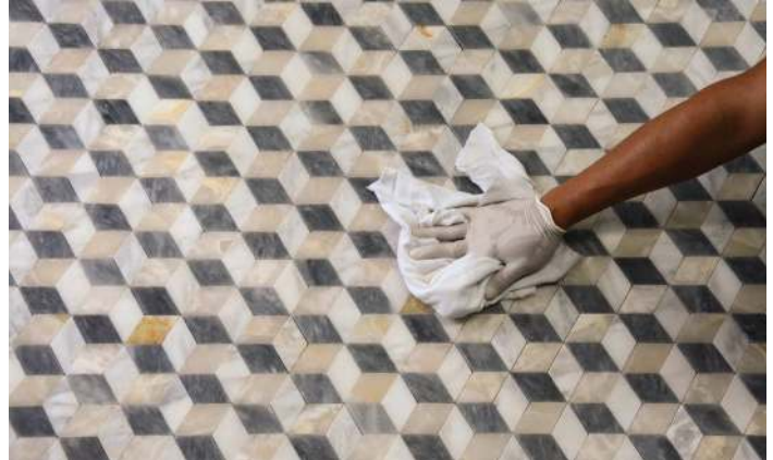
Step 7 Remove excess with a clean white cloth. Allow cure time per manufacturer's instructions.