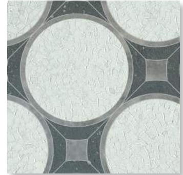
COLORS: AFYON WHITE, ALLURE (P), BASALTO ORVIETO (H)