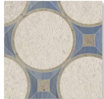
COLORS: IVORY CREAM, BLUE MACAUBA, JURA GREY (ALL P)